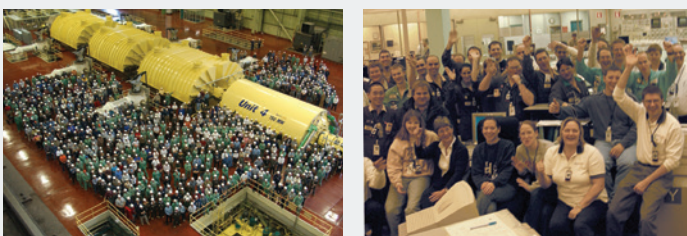
Unit 4 was returned to service in 2003 (left), while Unit 3 came back online in 2004 (right).

In 2001, Bruce Power became Canada's first private nuclear operator. Over the next 11 years, we worked to restart Units 1-4 , adding a boost to the grid while breathing new life into the region. The lifespan of the eight-unit site jumped from 2018 to 2035 , guaranteeing another generation of nuclear jobs in the area.